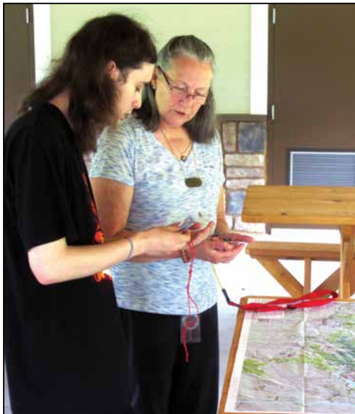
How to use a compass.