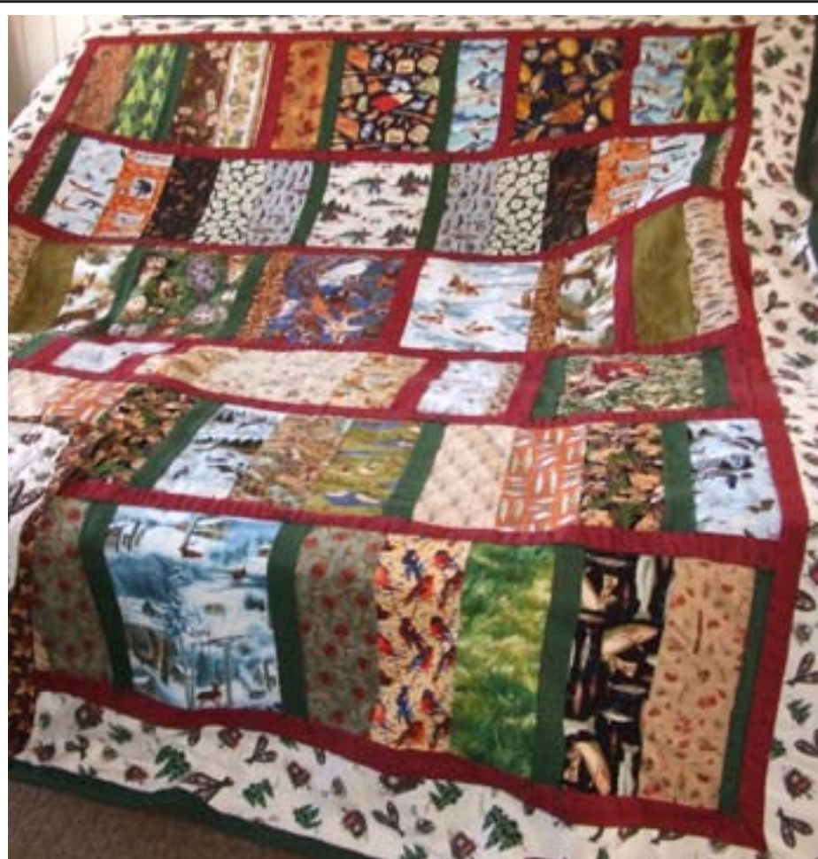
The Mary Tryon quilt we raffled in 2015.

For those who do not desire the 'wild taste' in bear meat, boil for about 10 minutes in soda water – one tbspc. soda to 2 qts water. Drain and the meat is ready for cooking or preserving.