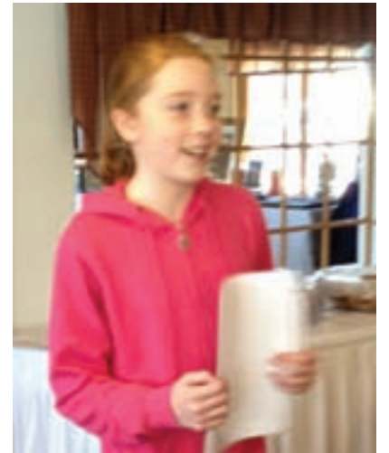
Thanks for sending me to camp!

Classified: Buy, Sell or Trade. 25¢/word, minimum of $5.00. Advertising rates are for camera ready copy, except for classifieds. All advertising is prepaid. Make check payable to NYSOGA.