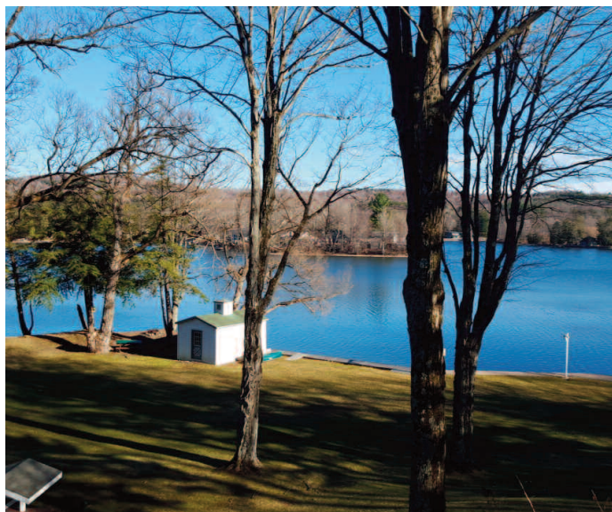
Lake Moraine in the Morning.