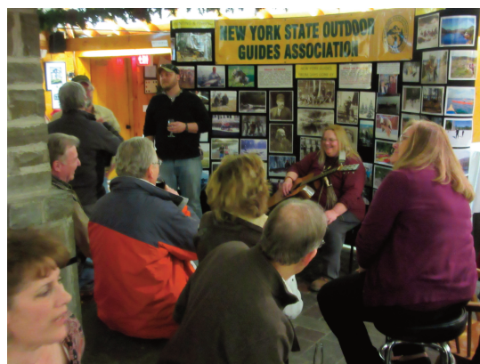
A Rendezvous song fest at the NYSOGA booth.