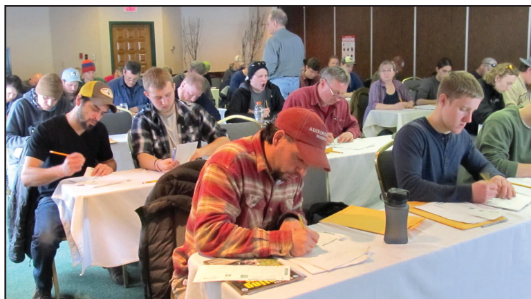
Many future guides took their written exams.