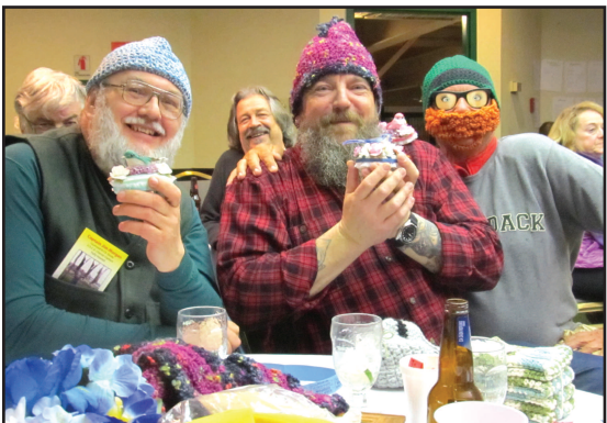
"Look at the door prizes we won!"