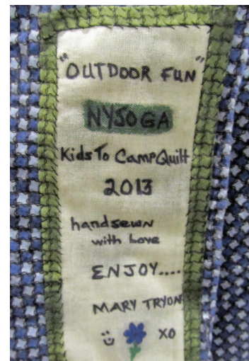
Mary's label on the quilt's reverse side.

To look over the details of the DEC Environmental Education Summer Camp Program and see a full explanation of the experience each camper will get, use the following computer