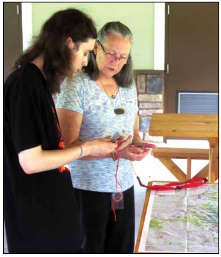
How to use a compass.