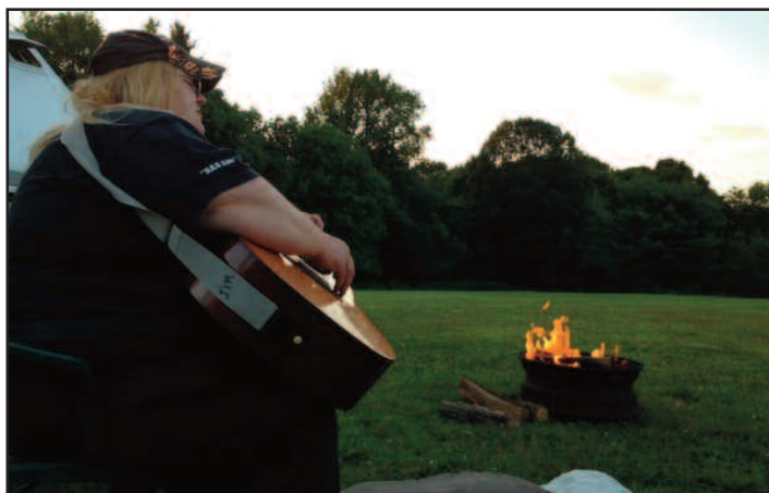
Music flowed like the river.