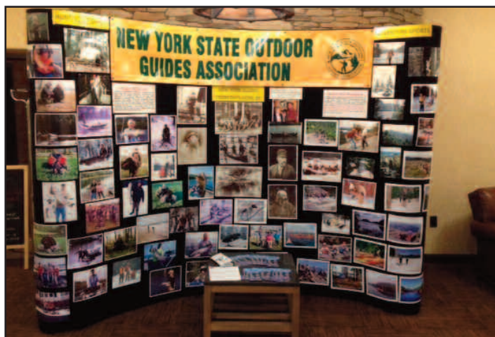
The booth at Tailwater Lodge