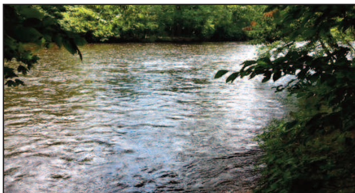
The Salmon River